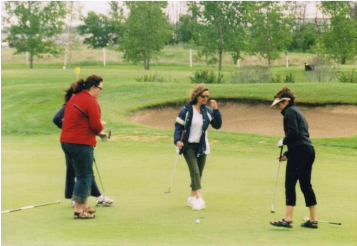
Team with the Best Score